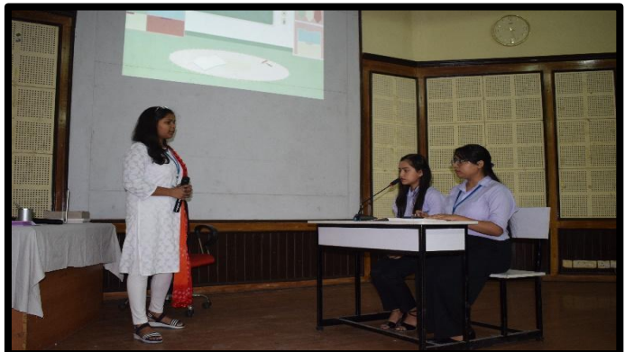
Roll play by the students